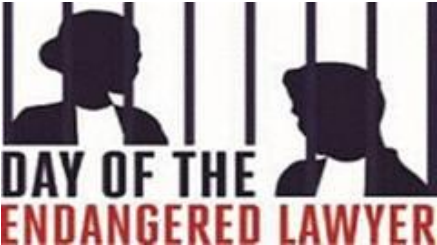
Day of the Endangered Lawyer

On the occasion of the 30th anniversary of the UN Basic Principles on the role of lawyers and in view of the above, the CCBE and all the undersigning organisations, therefore call for a more effective application of the guarantees provided by the UN Basic Principles on the role of lawyers and reiterates its strong support to the work carried out by the Council of Europe on a future European Convention on the profession of lawyer, considering that such a specific binding instrument is needed in order to preserve the independence, integrity of the administration of justice and the rule of law.