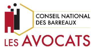
France – Conseil national des barreaux