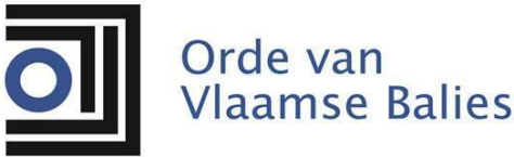
Belgium – Orde van Vlaamse Balies