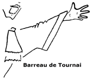
Belgium – Barreau de Tournai