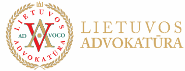
Lithuania – Lietuvos Advokatura