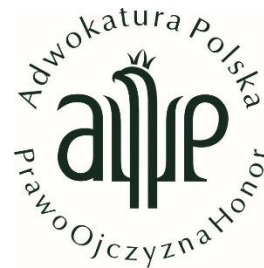
Poland – Naczelna Rada Adwokacka/The Polish Bar Council