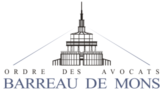
Belgium – Barreau de Mons